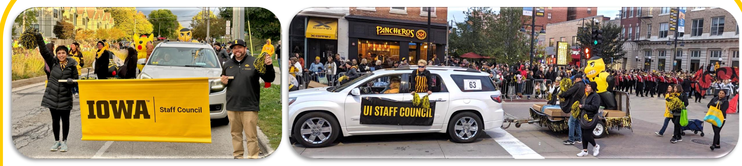
Homecoming • Hopewalk • Shelter House BBQ Bash