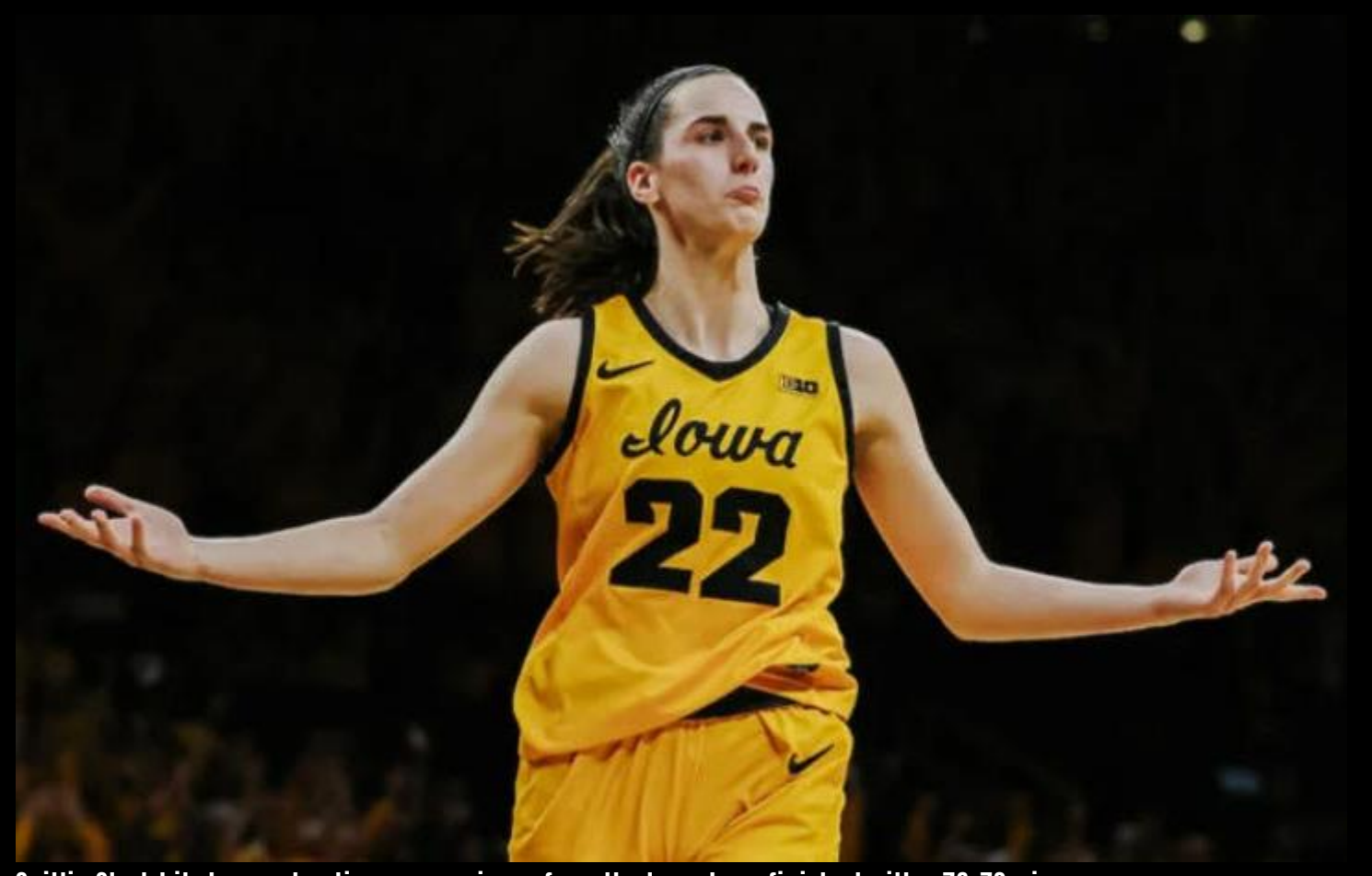
Caitlin Clark hits buzzer-beating game-winner from the logo. lowa finished with a 76-73 win.