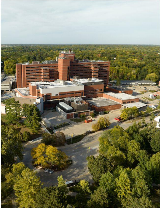
UIHC Leadership Meeting